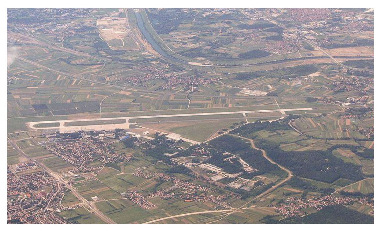
Figure 1: Aerial photo of Zagreb Airport current state

The project implies the construction of the New Passenger Terminal of the Zagreb Airport (NPT) with the supplementary connections to the infrastructure network, trafficable surfaces on the landside of the NPT (access roads, car parks), trafficable surfaces on the airside of the NPT (apron, rapid exit taxiway, access taxiways and de-icing area), energy plant, drainage and waste water treatment system. Regarding the runway and taxiways, this part of the project implies the construction of a rainfall drainage system; and regarding the existing apron, the project requires the connection of its current rainfall drainage system to the new drainage and water treatment system. The area of the construction of the New Passenger Terminal of the Zagreb Airport is of the total surface area of 1.3 km² and the area of the Concession is about 3.2 km².